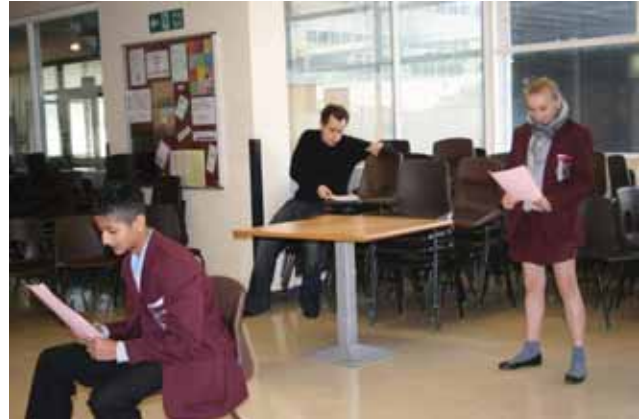
Grey in the Community students performing ‘A Christmas Carol’

who want it and the opportunity for everyone to embody the Grey College clique ‘get involved’. In the words of a previous President, ‘Grey is our little secret’ and despite the hard times that may lie ahead, I hope it will always continue to be that way.