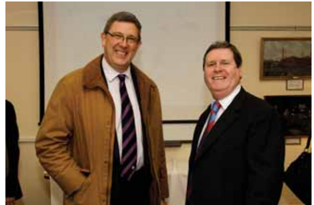
The Vice Chancellor with The President