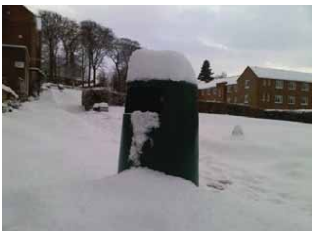
Grey in the snow, 2010

Although another year has passed within the Durham bubble and another set of finalists have ventured out into the real world, the Junior Common Room has refused to grow old. This year has seen the arrival of a new bunch of enthusiastic freshers who have injected a breath of new life into the JCR, whilst the old cohort have ensured that the JCR have focused on it's core values, in the face of many challenges that have threatened to change the Grey College that we all know and love.