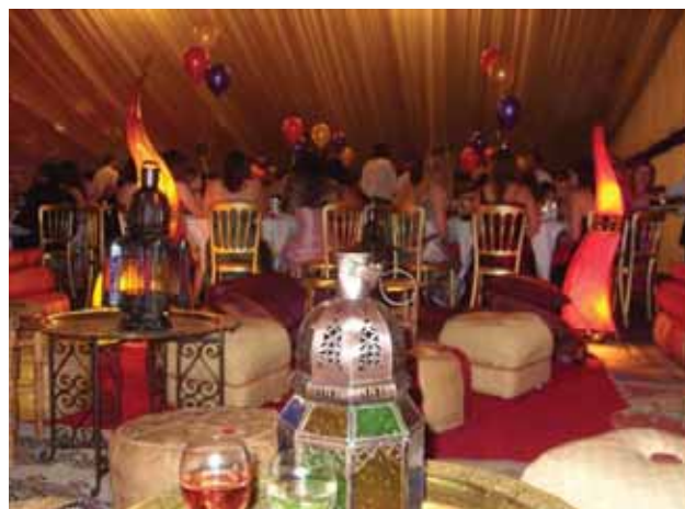
Phoenix Ball 2009: 'Arabian Nights' theme

Away from these difficulties, the JCR has continued to thrive and showcase the best of what Grey has to offer. At the time when this was written, Grey sat proudly top of the College Sports Table by 100 points and is currently on course to raise over £10,000 for charity; in doing so breaking the record for the most money raised in a year. The annual Barfest and Fireworks events brought the rest of Durham onto the hill and showed them how it really should be done.