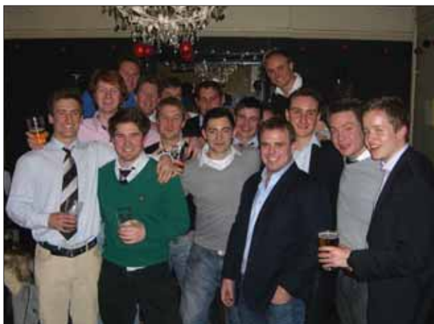
Cheeky Veteran Rugby Players

previous match in all respects and, but for a few choice refereeing decisions, could have gone either way (the author is still bitter!). On the 18th December 2009 a group of twenty two old boys met in Covent Garden for Christmas drinks and at the end of April 2010 are planning a match against the Durham Occasionals RFC in London. Needless to say the new club has been received with a great deal of enthusiasm from graduates and undergraduates alike.