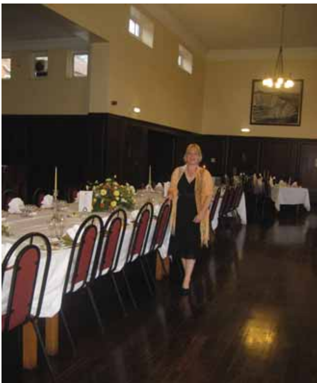
The Bursar inspecting the Dining Hall before the Association Dinner